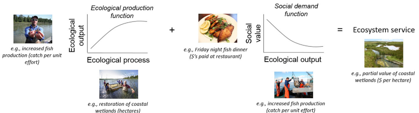
Fig. 1. Schematic of how the ecological production function and the social demand function interact to produce an ecosystem service.

The summit was funded and hosted by the Cooperative Institute for Limnology and Ecosystems Research (CILER), one of 16 NOAA-sponsored Cooperative Institutes throughout the USA. CILER commissioned a 3-person steering committee (authors BJC, ADS, WRM) to develop