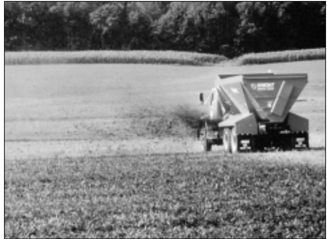
Side-delivery spreaders can apply solid biosolids very uniformly when using the surface application method.

The factor of greatest concern 10 to 20 years ago was high concentrations of heavy metals in biosolids. However, metal concentrations have been significantly reduced by industrial pretreatment programs mandated for industries discharging into sewage collection systems since 1980. To illustrate this decrease, Figure 2 shows the quality of biosolids produced in Michigan in 1980 charted against the average concentrations found in biosolids in 1995 and 1997. These concentrations are also compared with the Part 503 PCLs and CCLs. These data reflect the decline in pollutant concentrations during the