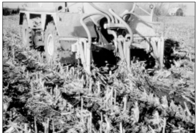
Applying liquid biosolids from the West Bay County TWTDS to cropland by injection into the soil.

Research and experience have shown that biosolids can be beneficial both as a soil conditioner and as a source of nutrients. Biosolids contain appreciable