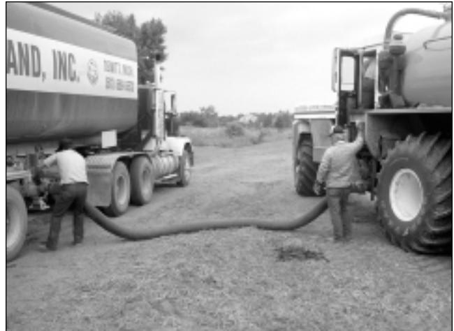
Liquid biosolids are transported to agricultural fields by large tankers and then transferred to applicators for injection into the soil (Benton Harbor-St. Joseph land application program).

One type of biosolids that is becoming more common recently is dried and/or pelletized biosolids. Because producing biosolids in this form is complex and expensive, dried biosolids are often blended with other materials and marketed as an organic-based fertilizer with balanced nutrient levels. Alkaline stabilization has been used to produce a nearly