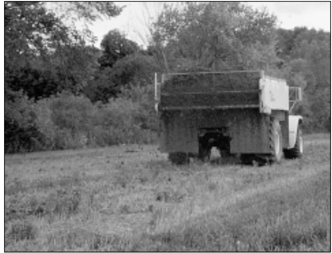
Applying Class A, EQ solid biosolids from Delta Township (Grand Ledge) to cropland for incorporation into the soil.

In addition, the Part 24 Rules include the following condition that expands the Part 503 definition of agronomic rate: